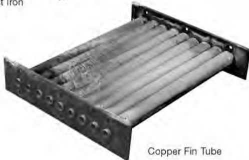
Copper Fin Tube

Today many of the challenges and assumptions that earlier boiler manufacturers faced no longer exist. Steam traps, de-aerators, and water treatment have largely eliminated cold feedwater problems. The old "minimum square feet of heating surface" rule has shrunk from 10 square feet per boiler horsepower in 1900 to around 5 square feet by 1960. And steam boilers themselves have been largely replaced by water heating boilers for comfort heat and other low temperature process applications. But one very big problem for all boilers still remains: SCALE .